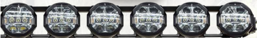
Scope 42" Light bar