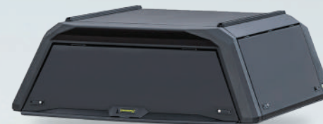
TRADIE SKU: IMALU-CPY138 TRADE