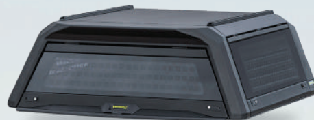
PREMIUM SKU: IMALU-CPY138 GLASS