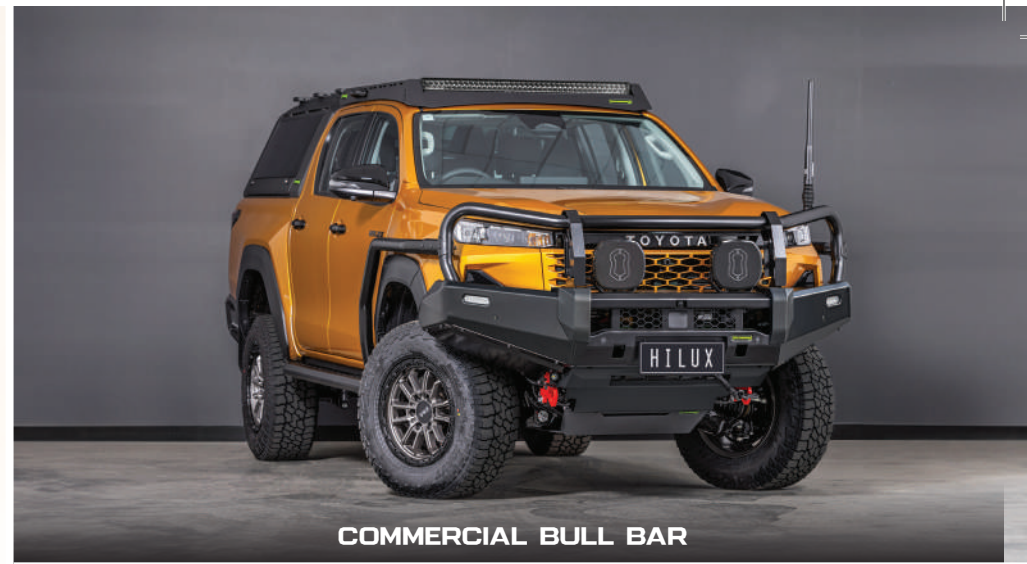
COMMERCIAL BULL BAR

● Winch with Steel Cable and Roller Fairlead is not suitable - Use Winch with Synthetic Rope and Alloy Hawse only