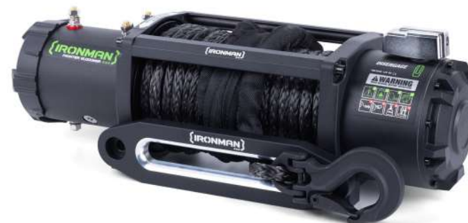
Synthetic Rope Winch