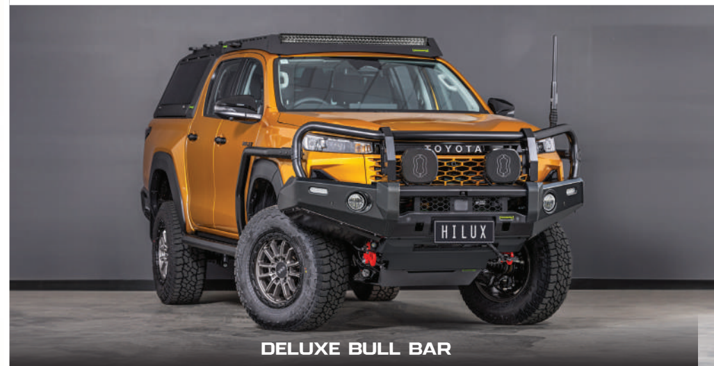
DELUXE BULL BAR