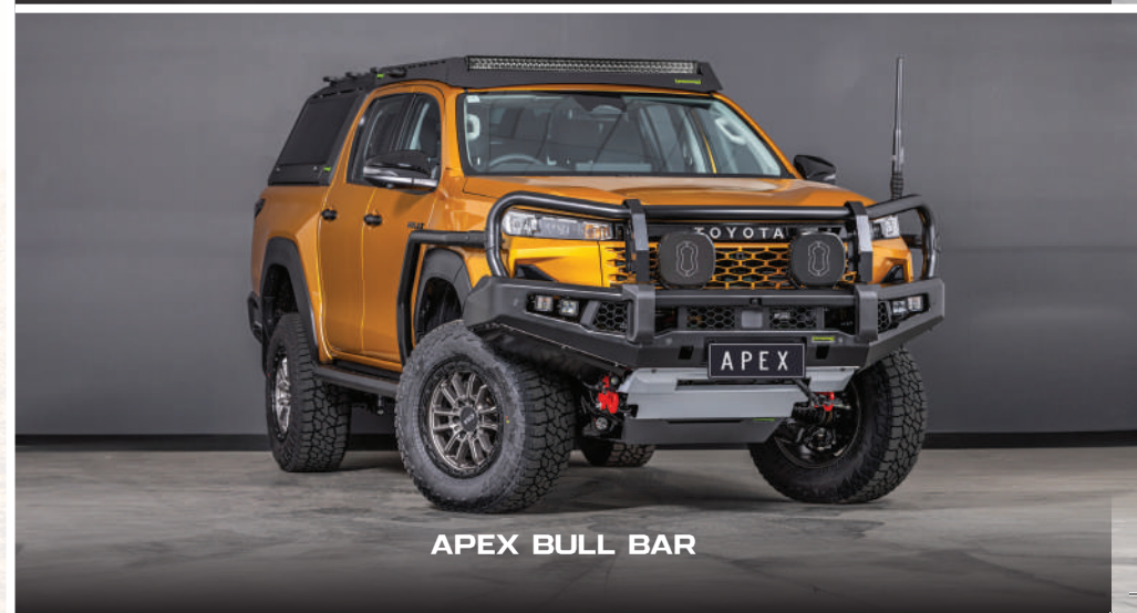
APEX BULL BAR